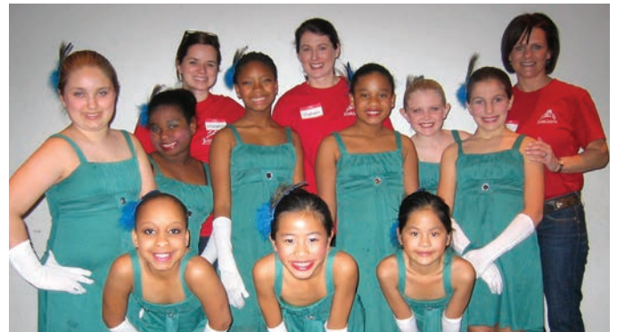
Junior League volunteers with community project Ready, Set, Dance students.

Bringing fitness through art to Baton Rouge children! Volunteers assisted the dance company Of Moving Colors in three programs: 1) National Dance Week, which features performances, lectures and educational lectures in Baton Rouge schools; 2) Dance for Health, a sponsorship event for youth modeled on the Jump Rope for Heart event; and 3) a community kids' performance with training in modern dance.