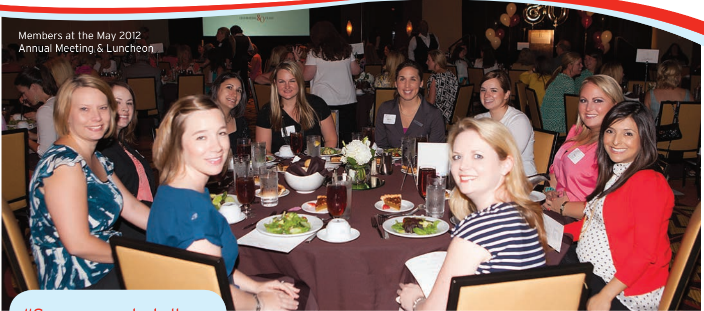
Members at the May 2012 Annual Meeting & Luncheon

"Some people talk about making a difference in our community. Junior Leaguers do make a difference. An excellent leadership training program enables women from all walks of life to make Baton Rouge a better place to live, work and play."