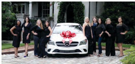
Hollydays Committee Members