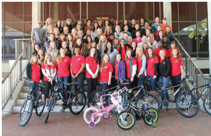
Provisional Members and Advisors at Build a Better BR Day

Provisionals were educated on all aspects of the inner working of the League, including presentations by each of the League's five councils and fundraisers.