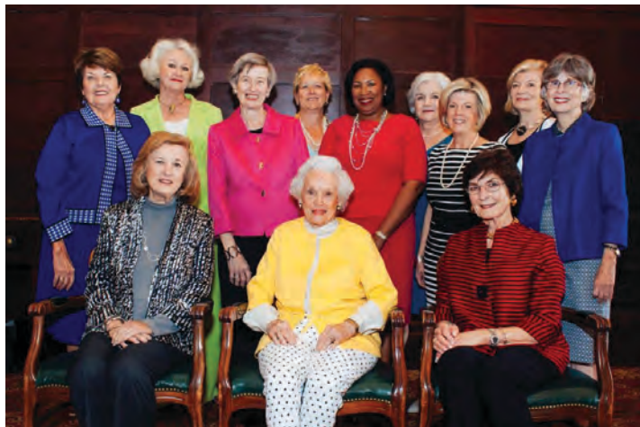
Past Sustaining Member of the Year recipients at the Sustaining Member of the Year Luncheon