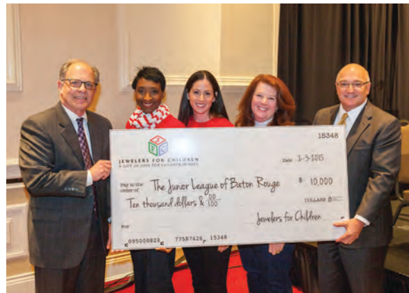
Junior League of Baton Rouge accepting Jewelers for Children Grant

The final two grants helped JLBR with our upcoming Diaper Bank's theme of No More Red Bottoms in the Red Stick. JLBR was the recipient of a $1,000 grant from ExxonMobil for use towards our upcoming Diaper Bank. ExxonMobil will also be partnering with JLBR for a diaper drive in the upcoming year. In addition, JLBR was awarded a $7,500 grant from Amerigroup. This generous grant will help provide up to 20,000 diapers to the Baton Rouge community.